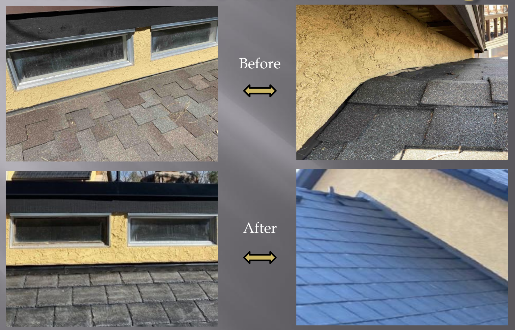
All About Stucco had to coordinate with roofers before and after install to cutback the stucco and then reskim it.